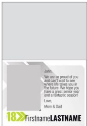
MEDIUM 5.5 X 4.25