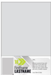
SMALL 5.5 X 2