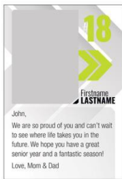
LARGE 5.5 X 8.5